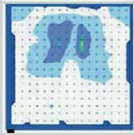
Reflexion Foam Seat