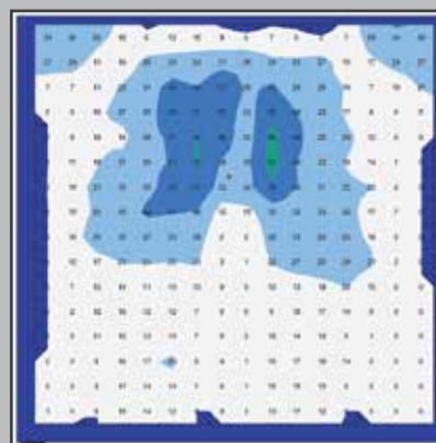
Reflexion Foam Seat