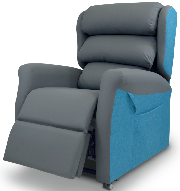
Fabric Shown: Highland Teal & Grey VP