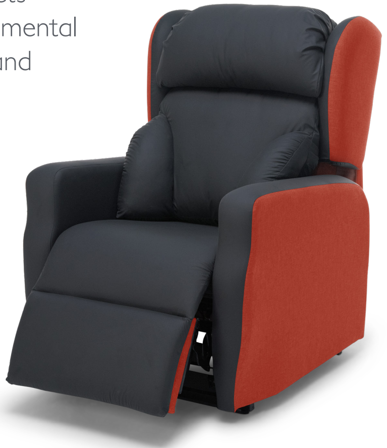
Fabric Shown: Highland Terracotta & Black VP