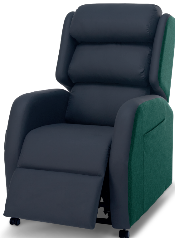
Fabric Shown: Highlight Forest & Black VP