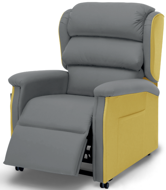
Fabric Shown: Highland Wheat & Grey VP