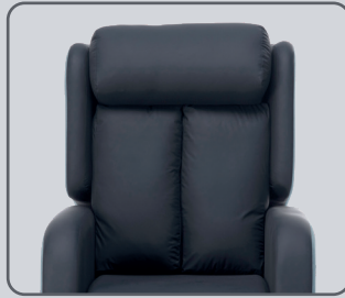
Vertical 2-Tier Drop Back

A classic fibre filled back cushion provides a soft feel and maximum comfort. The 2-Tier Drop Back comes fully adjustable with zip access at the rear to offer bespoke support around the back area.