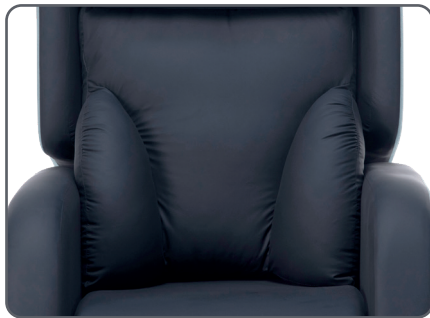
Inbuilt Lateral Support

The Harmony-Flex offers a Lateral back cushion as standard, providing strong postural support to meet the majority of non-critical users.