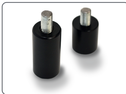
Seat Height Adjustability

The Harmony-Flex offers complete footboard adjustability of up to 2" which is achieved from the underneath 'turn wheels' of the footboard.