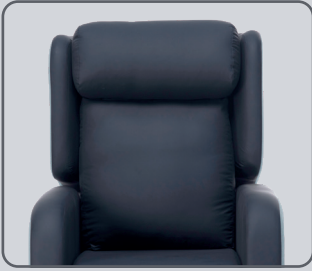
2-Tier Drop Back

A classic fibre filled back cushion provides a soft feel and maximum comfort. The 2-Tier Drop Back comes fully adjustable with zip access at the rear to offer bespoke support around the back area.