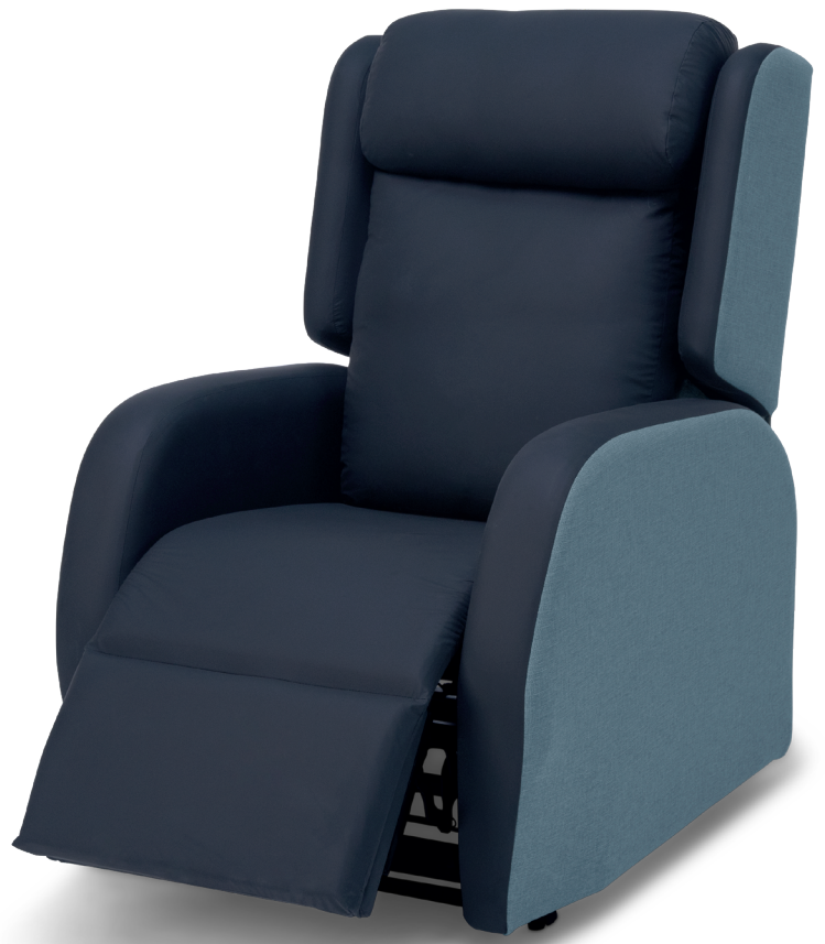
Fabric Shown: Highland Stretch Cardamon & Black VP