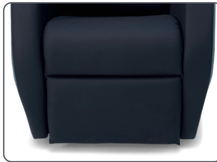
Moving and Handling

The Harmony-Flex offers a Lateral back cushion as standard, providing strong postural support to meet the majority of non-critical users.